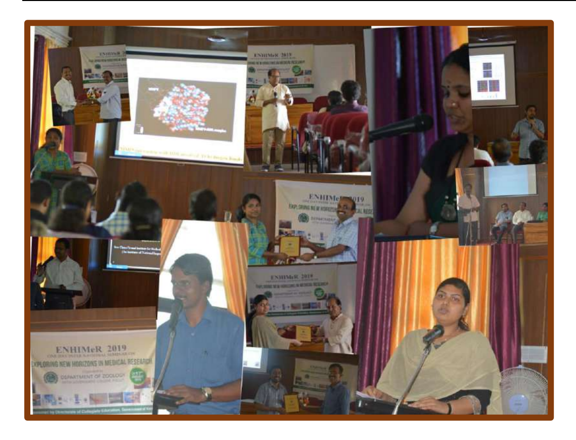
International Seminar on Exploring New Horizons in Medical Research