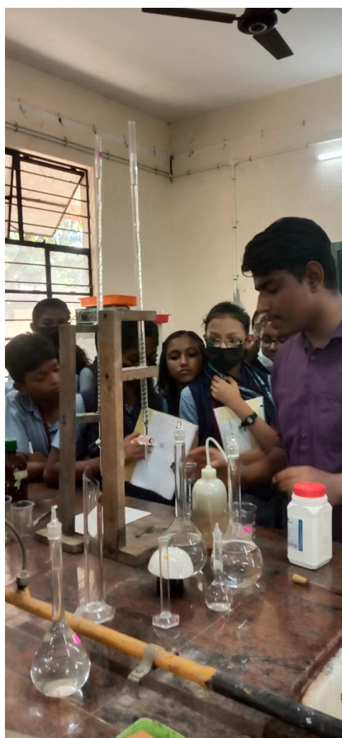
Science expo-2023 on 24/02/2023