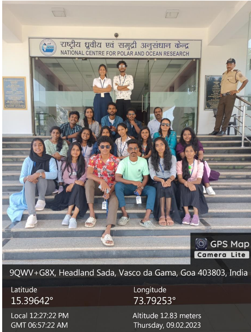
Final Year Student at NPRI Goa for IV