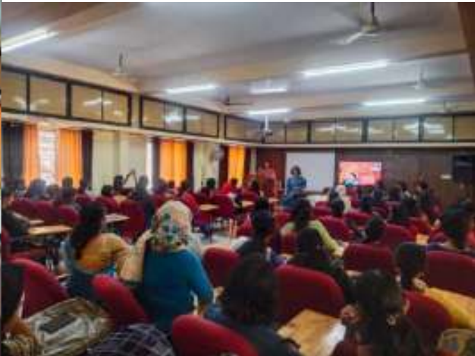
WOMEN'S DAY SEMINAR A Talk by Smt.Jolly Chirayath (Cine Artist and Activist)