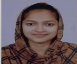
JAFSA (I Zoology)